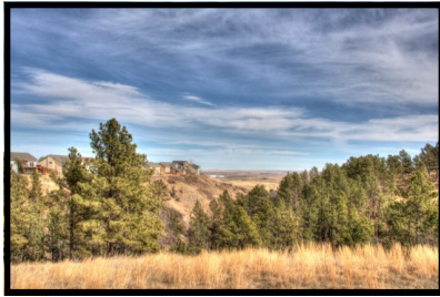
Single Family - Lot 4