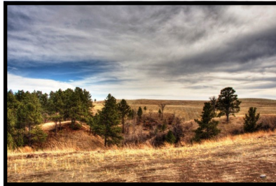
Townhome - Lot 6